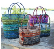
Aunties Two Camden Bag

Is there a project in the store that you would like to do in a class? Let us know!