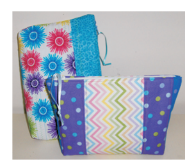
Fashion Forward Zippered Pouch

Fun, practical and useful! Ages 10 and up July24 10:30-1:30 $30 plus materials