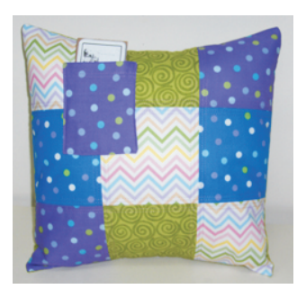
I-Pillow Cozy up with your music...enjoy! Ages 8 and up July 23 10:30-1 $25 plus materials

Fun, practical and useful! Ages 10 and up July24 10:30-1:30 $30 plus materials